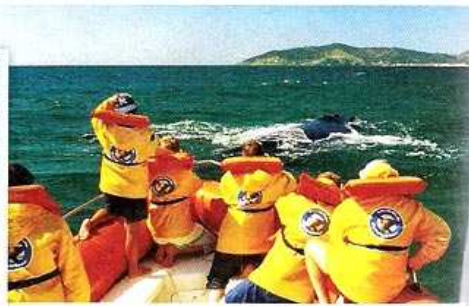
clockwise from above / Praia do Espelho's secluded shore in Trancoso; Southern right whale-watching in the waters off Praia do Rosa island; Paraty, a charming and picturesque colonial town between Rio de Janeiro and São Paulo